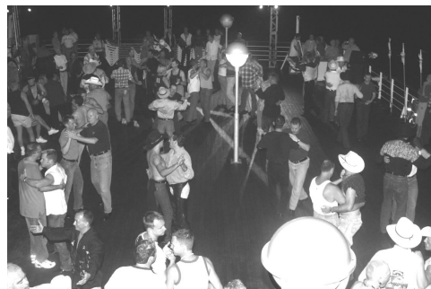
COUNTRY-WESTERN DANCING ON THE RSVP CARIBBEAN CRUISE, FEB. 2004

MAY 28 – GAY DAY AT GREAT AMERICA. This year Sundance Saloon will present country-western dancing at the ever-popular Gay Day at Great America. Now you can enjoy two-stepping in addition to all the rides, entertainment, and festivities. And we have discount tickets for you! The regular price is $39 in advance, but you can get yours for $35, and only $30 if you're a member of the Sundance Association.