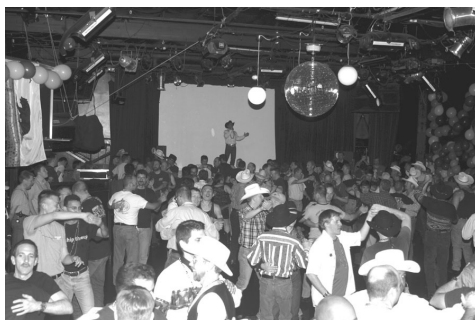
SUNDANCE SALOON'S 6TH ANNIVERSARY TAKES PLACE APRIL 18, 2004