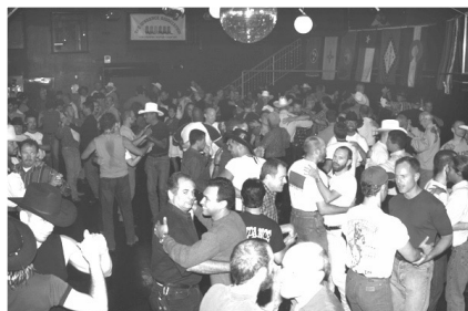
SUNDANCE SALOON'S 5TH ANNIVERSARY PARTY: APRIL 20

The Sundance Association has been traveling! We enjoyed the hospitality of our fellow New Yorkers at the NYC Hoedown Feb. 14-16. They put on a huge and wonderful country-western dance weekend for the 2002-3 semi-annual convention of the IAGLCWDC. Even a President's Day blizzard didn't keep us from having fun: The Sundance Association organized the impromptu Blizzard Ball