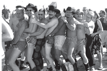
RSVP MEXICAN RIVIERA CRUISE

OTHER COMMUNITY EVENTS. There's lots of dancing going on in the Bay Area – too much to list it all here – but you can find it all at www.sundancesaloon.org!