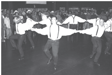
THE BARBARY COAST CLOGGERS AT SUNDANCE SALOON'S 6TH ANNIVERSARY

SUNDANCE SALOON GOES TO PARAMOUNT'S GREAT AMERICA