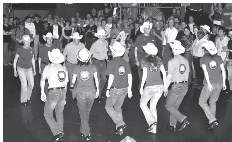
SUNDANCE SALOON 8th ANNIVERSARY The Golden Gate Clogging Company

We've got a great San Francisco Pride weekend coming up (see below), and more dancing this summer than San Francisco has seen in a long time. Remember, the Sundance Association is an all-volunteer 501c3 non-profit organization. You can help us keep all of our projects going with your volunteer help, with your membership, or both!