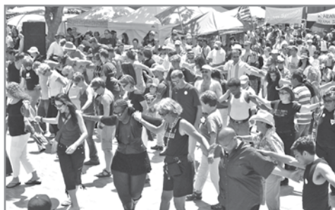
SF PRIDE AT THE CIVIC CENTER

As always, Sundance Saloon remains an all-volunteer, nonprofit organization. For more information on volunteering and memberships, please visit www.sundancesaloon.org .